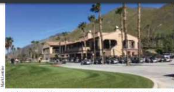
Soboba Golf Club, the heart and hub of "The Weekend" community event.

There were not only golfers signing up, but many brought family members to the outing as well, giving the event a true family feeling. You'd be hard-pressed to find a more diverse, positive crowd at any venue as was seen at