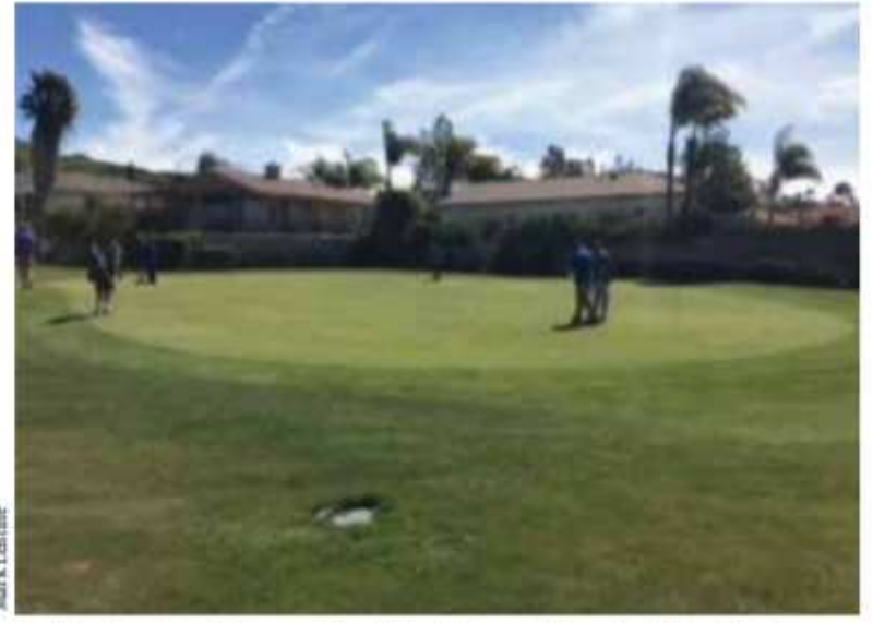
A critical moment for a golfer, lining it up and tapping it just right.

The golf outing, held on Friday, Mar. 15, kicked off The Weekend festivities. The scramble-style golf game, which featured 144 golfers, was a perfect way to start off the weekend, have fun and raise money for a worthy cause. "The Valley-Wide Foundation, through the Friends of Valley-Wide [friendsofvalleywide.org]