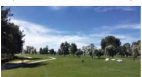
Hook, slice or straight ahead, it's all about spin.

And charity it is, which has allowed hundreds of children in need to enjoy many hours of outdoor and sports activities that they may have otherwise missed. This is one 'Weekend' you don't want to miss in the future.