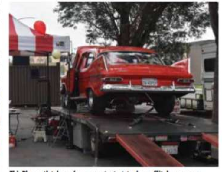
This Plymouth takes a dynamometer test, to show off its horsepower.