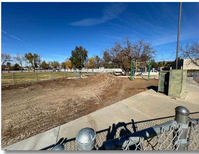
Louis M. Jackson Park

The parks will remain open during the construction project, with temporary closures of some amenities.