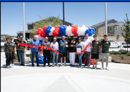
Veterans Park Grand Opening