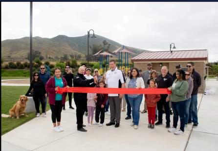
Eagle Crest Park Grand Opening